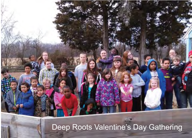
Deep Roots Valentine's Day Gathering